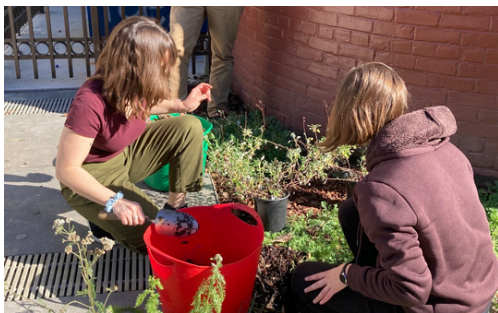
Volunteers helping plant our church CA native garden at one of our CommUUnity Gardening Days.

We are working for peace and freedom for all and we bring it into our spiritual home by taking care of one another through our Pastoral Associates and Caring Hands groups. Volunteers help when congregants need a listening ear or support.