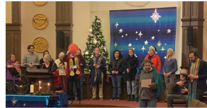
Our no-rehearsal intergenerational holiday pageant was a blast!

Dynamic worship and Small Group ministry brings us together and helps each of us create meaning. We greet one another either in-person or through Zoom to connect, find delight, and form life-long friendships.