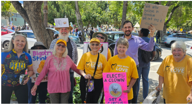
Member of the FUCSJ community at the June No Kings protest

Our church provides a strong voice for justice in the community through groups like our new Environmental Justice Ministry, Homeless Concerns, and Immigrant Accompaniment Team. We collaborate with South Bay Indigenous Solidarity and People Acting in Community Together (PACT). And our congregants show up in public to support equity and justice for all.