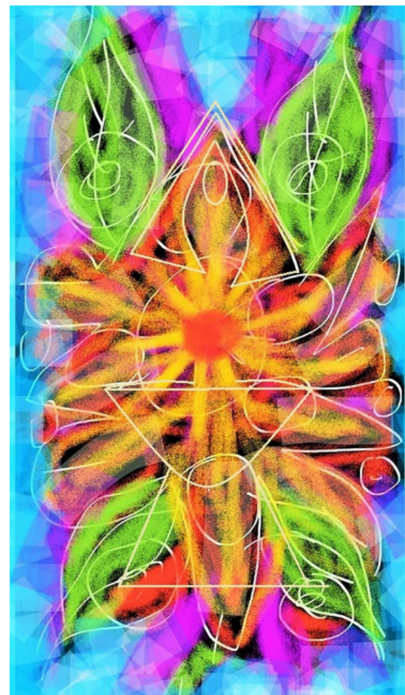
Art by Ervin Barrios