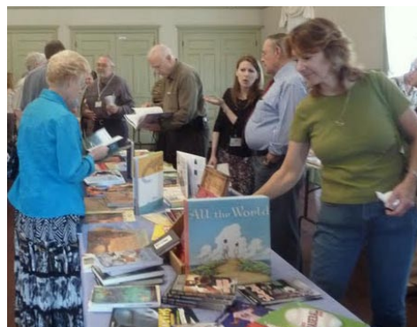
The book fair fund-raiser in HPH held Sunday, October 18, featured books chosen for especially for our wide-ranging interests by the “Book Elf” at Hicklebee’s.