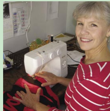
Mending & alterations?