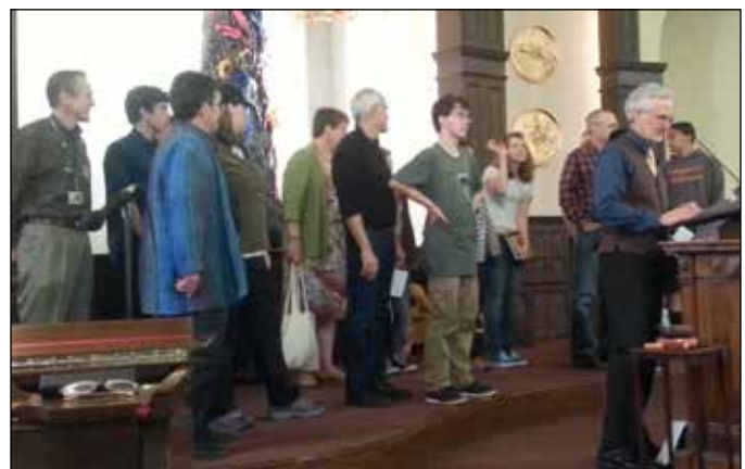
Mentors and Youth celebrate Coming of Age Sunday, May 17