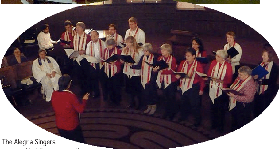
The Alegria Singers sang and led the congregation in singing three well-known Israeli songs: Lo Yisa Goy , Hine Ma Tov , and Shalom Haverim .